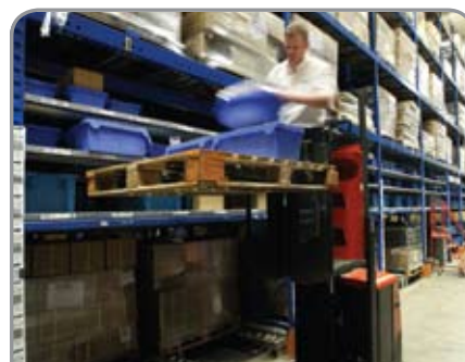
Productive Order Picking

We feel our business has benefited from working with an experienced materials handling provider who not only has a comprehensive range of products, but has also taken the time to fully understand our business and recommend the most effective solutions for us.”