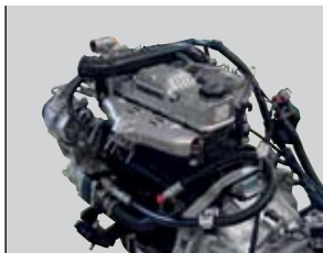
A choice of 2 Toyota Diesel engines is available depending on power requirements