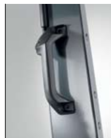
Rear Assist Grip