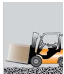
Hydraulic Cushioned Forks